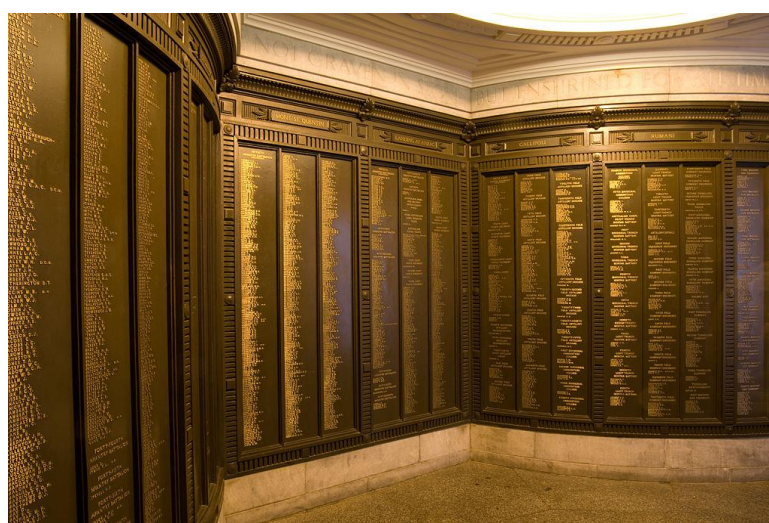
National War Memorial – Adelaide