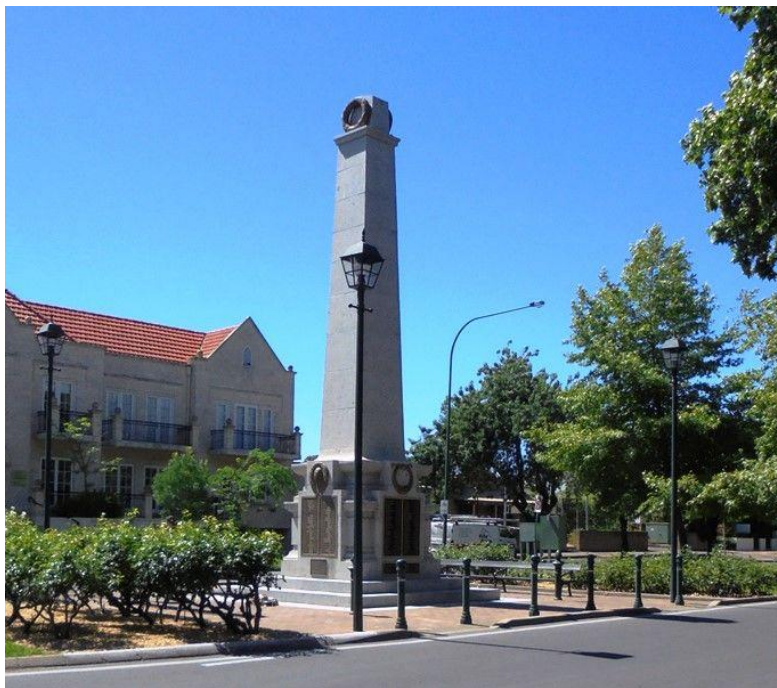
Norwood War Memorial

Pte V. Best is remembered on the Norwood War Memorial, located at Osmond Terrace & The Parade, Norwood, South Australia.